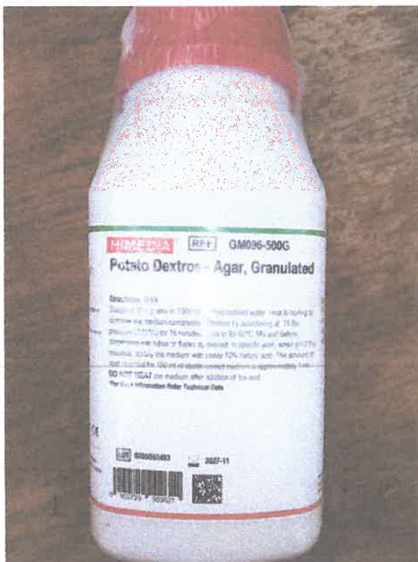
PDA (Potato Dextrose Agar), Granulated 500g/bottle